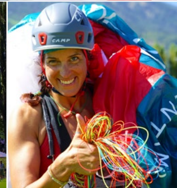
Red Bull Dolomitenmann 2023